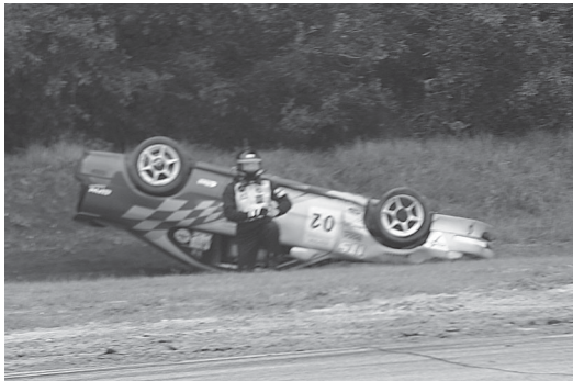
Uh, what's wrong with this picture?